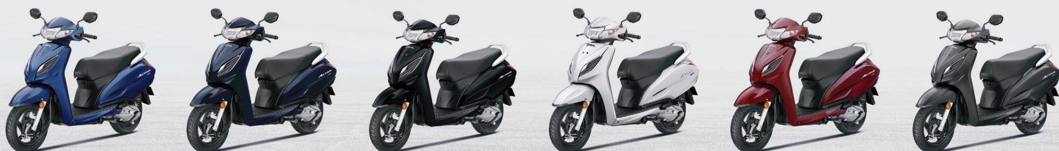
Decent Blue Metallic